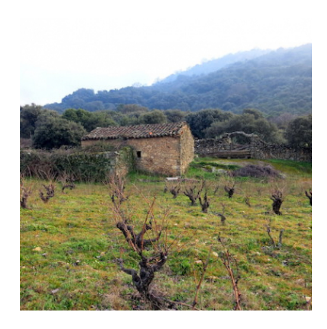
The Spanish region with the greatest diurnal temperature variation.

Méntrida with its 8,100 ha (20,000 acres) of vineyard might be a bit unfamiliar to international consumers. However, for Spaniards and especially for Madrid inhabitants, it is quite a popular name. The region is in the north west of Toledo province to the immediate south of Madrid.